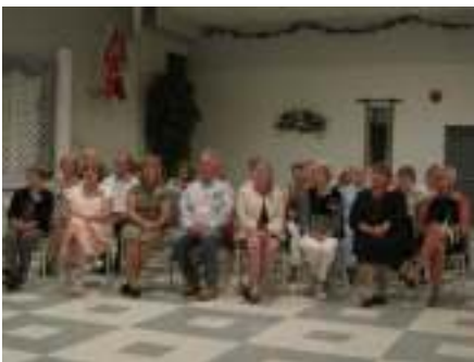
GEETF "Graduates" 2012. Good luck in the next phase of your career—retirement!

On March 1st, our LTD plan was renewed. Due to an error on OTIP's behalf, the Posaction Plus component of the premium was not included for March and April. To rectify this problem, we have agreed that the rate for September to February will be changed from 1.726% to 1.745%, which for an $80 000 salary would work out to approx. $1.52/month. Hopefully this will not be too much of a challenge for some members. On the bright side, remember that for June we did have a "benefit holiday" mentioned in the last newsletter.